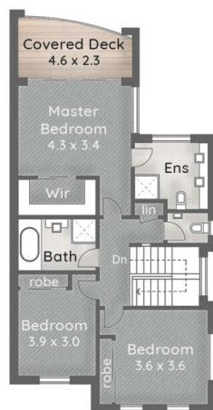
:: FLOOR PLAN First Floor