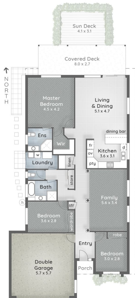
:: FLOOR PLAN