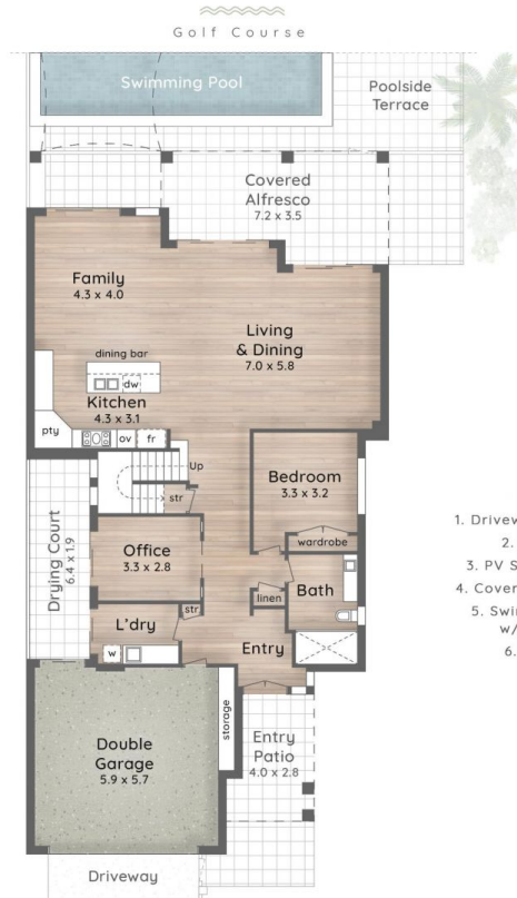
:: FLOOR PLAN Ground Floor - 2.7m Ceiling