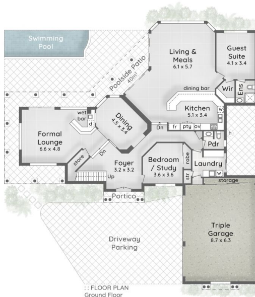
FLOOR PLAN Ground Floor Ceiling up to 3.1m