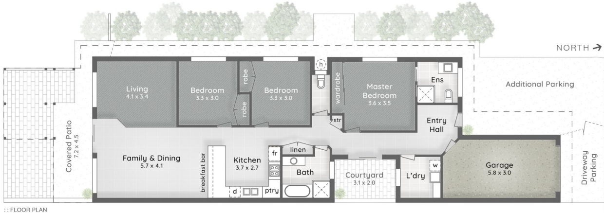
::: FLOOR PLAN