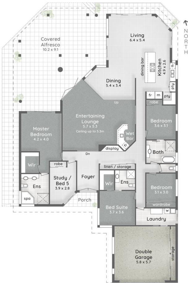
:: FLOOR PLAN 2.7m Ceiling