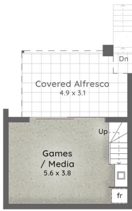
:: FLOOR PLAN Basement - 2.6m Ceiling