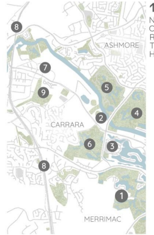
:: LOCATION MAP