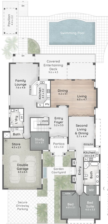
:: FLOOR PLAN Ground Floor - 2.7m Ceiling