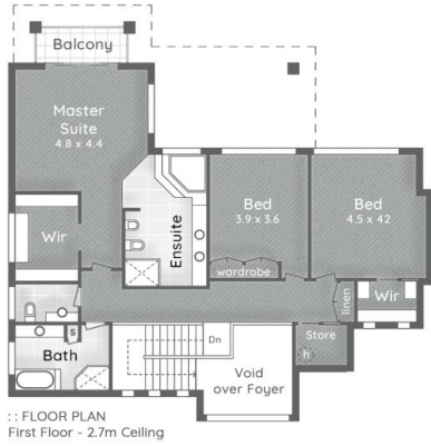
:: FLOOR PLAN First Floor - 2.7m Ceiling