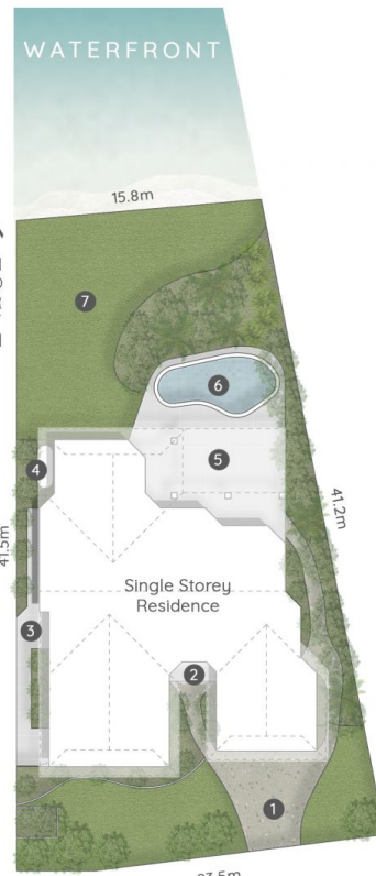
:: SITE PLAN