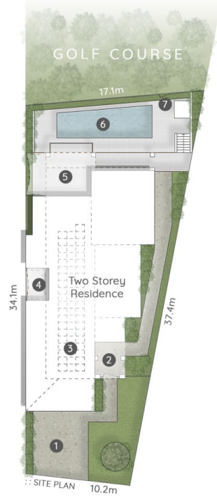
:: SITE PLAN 10.2m