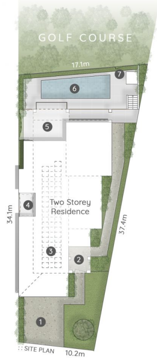
THE INNER CIRCLE