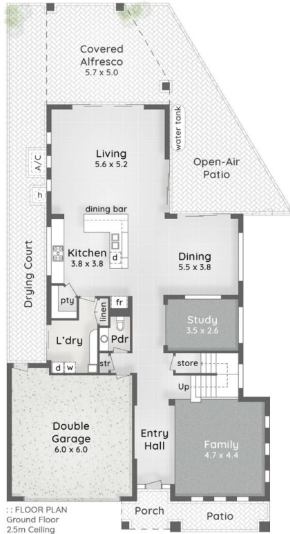
:: FLOOR PLAN Ground Floor 2.5m Ceiling