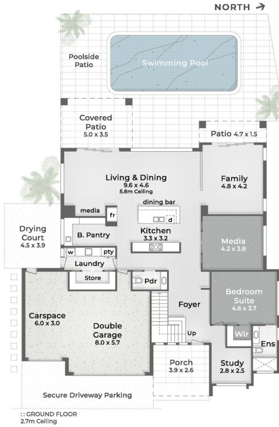
:: GROUND FLOOR 2.7m Ceiling