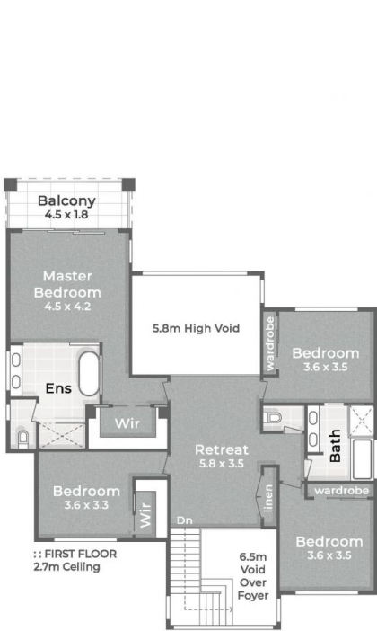
:: FIRST FLOOR 2.7m Ceiling