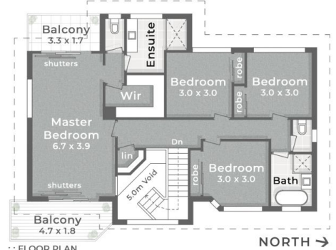
:: FLOOR PLAN First Floor