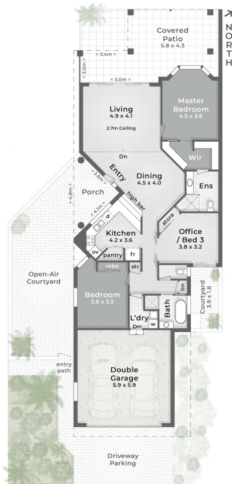
:: FLOOR PLAN - 2.5m Ceiling