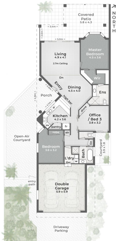
:: FLOOR PLAN - 2.5m Ceiling