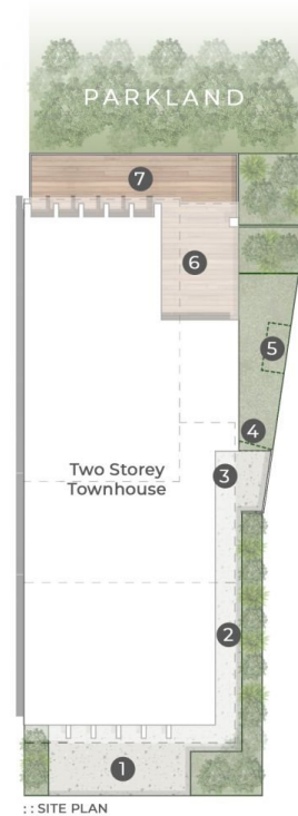
:: SITE PLAN