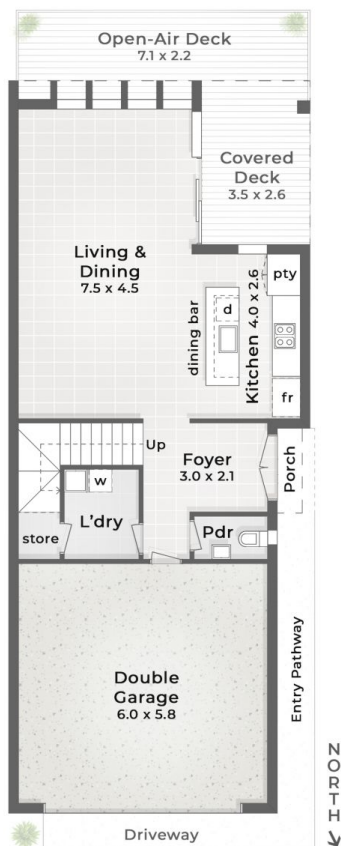
:: GROUND FLOOR 2.5m Ceiling