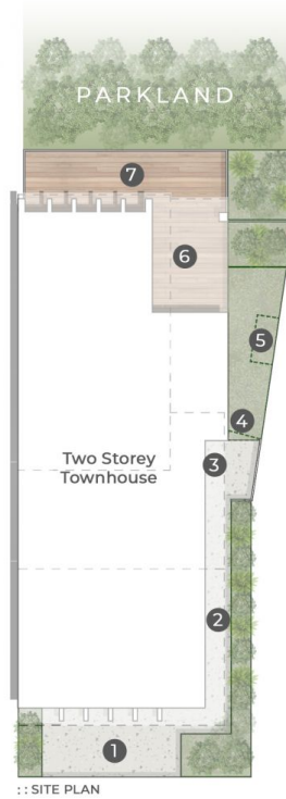
DRIVEWAY ACCESS TO EASTHILL DRIVE