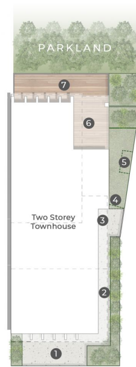
:: SITE PLAN