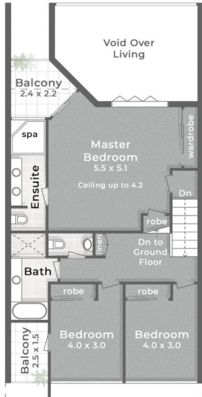
:: FIRST FLOOR Ceiling up to 3.8m