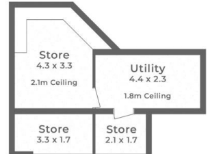
:: UNDERHOUSE (Not Actual Location)