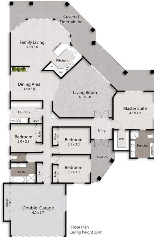
Site Plan :