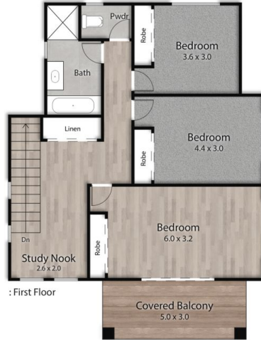
: First Floor