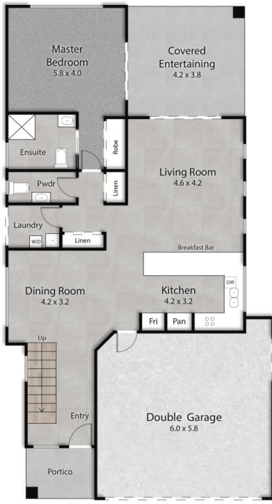
: Ground Floor